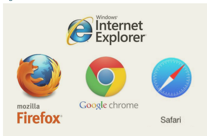
Figure 5: Browsers

Recommended browsers for the best experience in Moodle are Mozilla Firefox , Google Chrome , Safari 6 for OSX 10.7 or later, Internet Explorer 10 or later. Moodle will also operate with other browsers but some features may not work as intended.